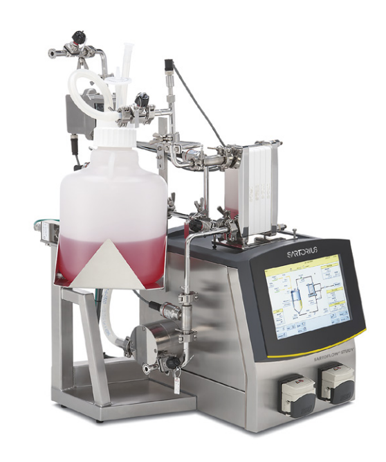
Sartoflow® Study filtration module with tank (316 L) module